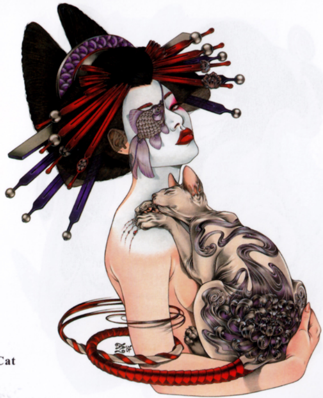
Geisha with Tattooed Cat Mixed media on paper 16 1/2"x11 1/2"