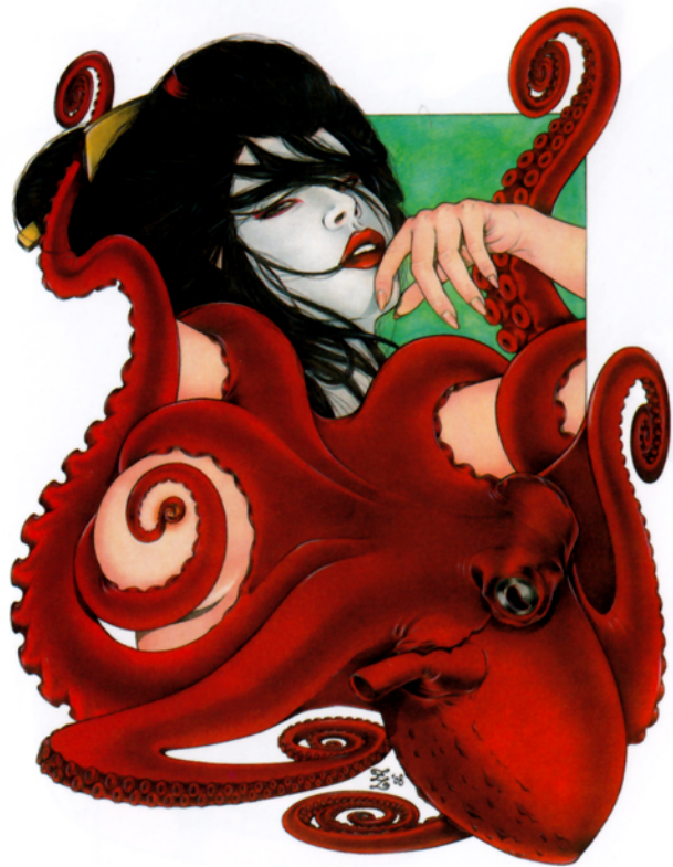
Geisha with Octopus Mixed media on paper 16 1/2"x11 1/2"