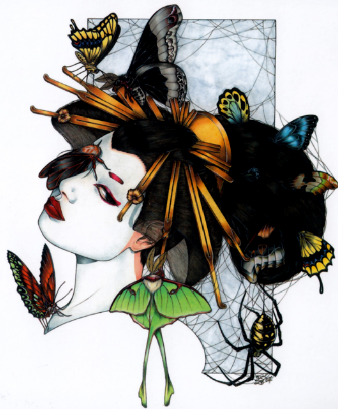
Geisha with Spider Mixed media on paper 16 1/2"x11 1/2"